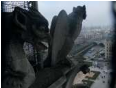
Paris on the roof of Notre Dame